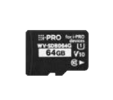
WV-SDB064G i-PRO SD Memory Card