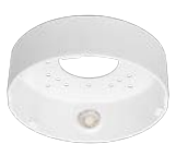
WV-QJB505-W Base Bracket