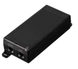
WJ-PU201P PoE Injector