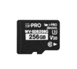
WV-SDB256G i-PRO SD Memory Card