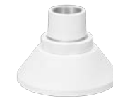
WV-QSR506F-W Mount Bracket