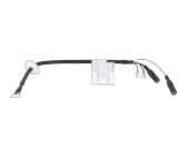
WV-QCA501A I/O Cable