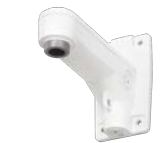
WV-QWL506M1-W ANSI Male Wall Mount Bracket (1.5"NPT)