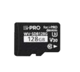
WV-SDB128G i-PRO SD Memory Card