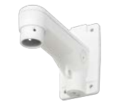
WV-QWL506-W 4-screw Wall Mount Bracket

Select a compatible accessory Accessory Selector (i-pro.com) .