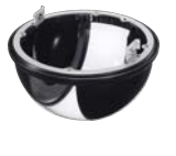
WV-QDC508CN Dome Cover