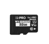
WV-SDB032G i-PRO SD Memory Card