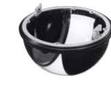
WV-QDC508C Dome Cover