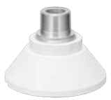
WV-QSR506M-W Mount Bracket