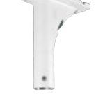
WV-QCL501-W Mount Bracket