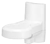
WV-QWL502-W Mount Bracket