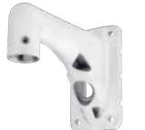
WV-QWL501-W Mount Bracket