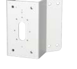
WV-QCN500-W Mount Bracket