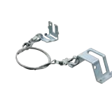
WV-Q105A Mount Bracket