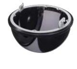
WV-QDC508G Dome Cover