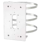
WV-QPL500-W Mount Bracket