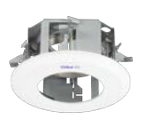
WV-QEM505-W Ceiling Mount Bracket