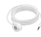
WV-PM500 Compact microphone unit